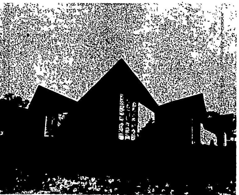
The new Our Lady of Mt. Carmel Parish Church, completed in 1967.

Under Father Delay's leadership the parish built a new church which was completed in 1967. The $300,000 triangular structure was built with funds left to the parish by a Lawler businessman, Frank Eichhoff. A parish hall, with kitchen facilities and seating room for 600, is contained in the basement of the new church. The church itself is capable of seating 600 parishioners, a far cry from the capacity of the 40 x 80 foot $5,500 frame structure built by Father Farrelly back in 1871.